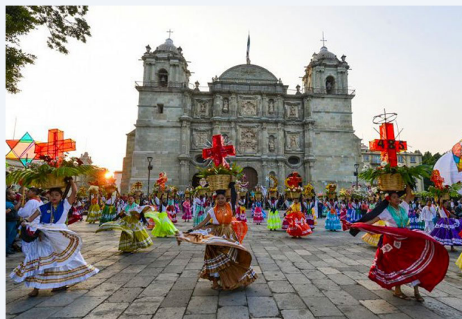
The Mexican State of Oaxaca

panic Serving Institution in the near future, this research and study abroad program will contribute to the needs of our EWU community.