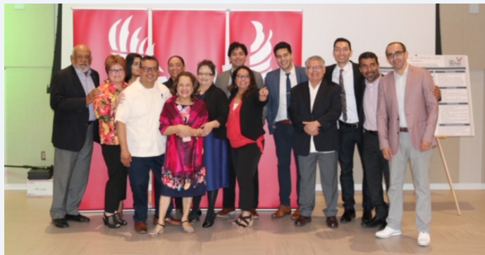
This photo exhibits Chicana Studies Alumni, Founders, Faculty and Staff

On the academic component; scholars, higher education experts, educators, students, community leaders, local activist, students, alumni, professionals, state government representatives, non-profit organizations and local activist answered the call for submissions for presentation proposals; over 21 abstract/proposals were accepted and over 26 presenters provided training to EWU staff and faculty on a range of issues consistent with the Hispanic Serving Institutions (HSI) objectives. Additionally, over 51 certificates of completion were issued to mainly EWU staff & students for attending a full day's worth of workshops. The idea behind this effort is to impart knowledge that will help EWU faculty and staff develop knowledge/skills/expertise to best serve students of color including Chicana/Latina.