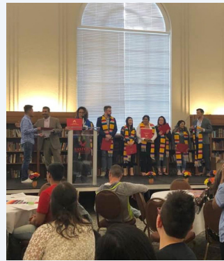
In this photo, Chicax Studies Minors take center stage at the CEP Graduation Ceremony.