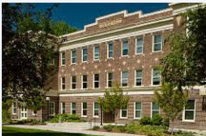
EWU's Monroe Hall