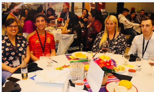
Avista Corporate Sponsor Representatives