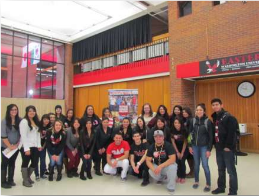
Top Left: Students involved in the Cesar Chaves Blood Drive.